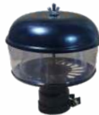
MASSEY BOWL 7" 1693129M1