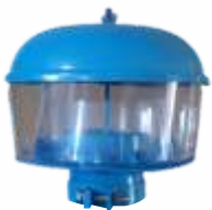
ZETOR 70 MM