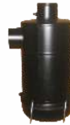
VOLVO AI CLEANER ASSY