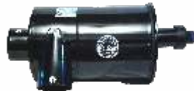
TRUCK 2515 EX ASSY