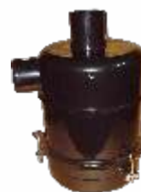
AIR CLEANER FOR GENSETS