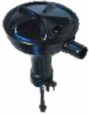
OIL SEPERATOR MERCEDES