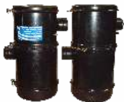
Bison POLMO Gf76000 GF- ZSM-COMBINE