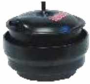
OIL BATH FOR BEDFORD TK-330 ENGINE