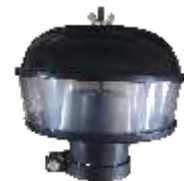
MASSEY BOWL 7" 57 MM