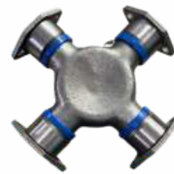
Novus 49 x 192