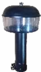
MASSEY 7" WITH PIPE 1675011M1