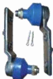
KUBOTA TRACTOR END