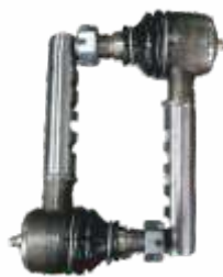
URSUS 360 5 SLOT END