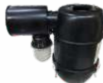
BETICO COMPRESSOR AIR CLEANER 4000240