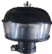
MASSEY - BOWL 6"