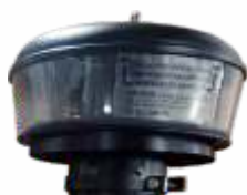
10" BOWL - 4" ID