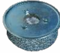
HYDRAULIC FILTER STRAINER