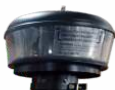
10" BOWL - 4.5" ID