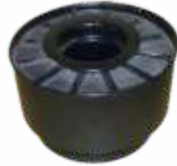
ELEMENT BEDFORD TK 330