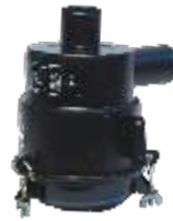
AIR CLEANER FOR DIESEL ENGINE