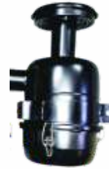
VOLVO EC350D DIESEL ENGINE OIL BATH AIR FILTER