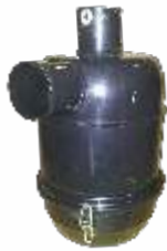
MITSUBISHI UPPER PIPE