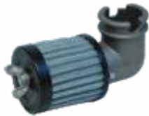
AIR CLEANER ZENITH FLAME ARRESTOR