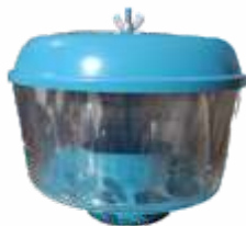
ZETOR 80 MM